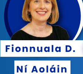
Fionnuala D. Ní Aoláin NORTHERN IRELAND